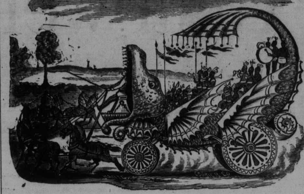
AND HELP TO CELEBRATE OUR QUEEN'S BIRTHDAY!

Excursion Trains on all Railroads AT GREATLY REDUCED RATES.