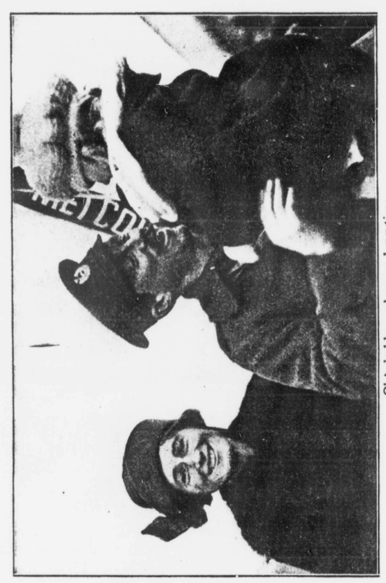
Oh! daddy, oo' was a long time.