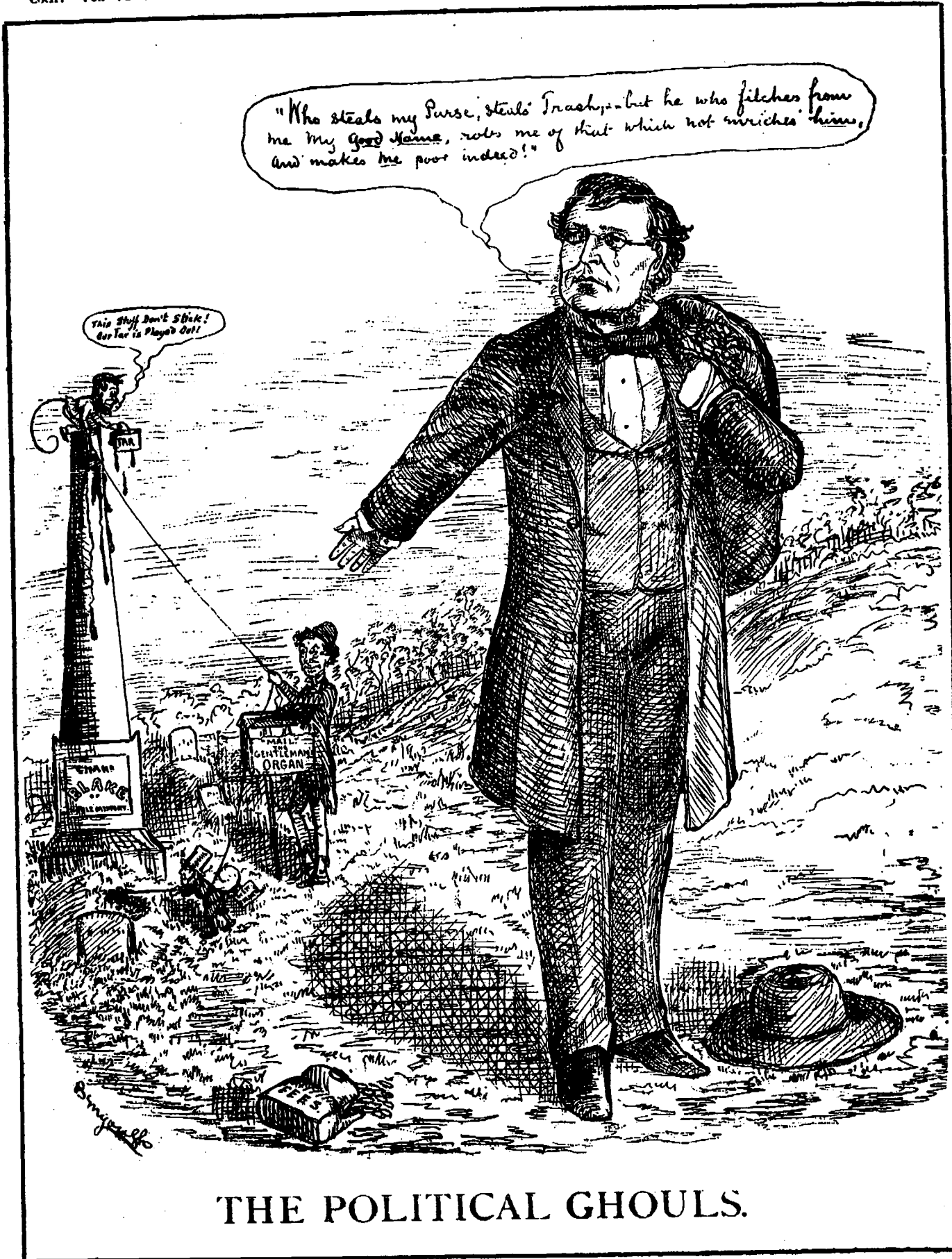
THE POLITICAL GHOULS.