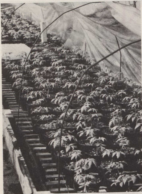
Tomato plants inside a tunnel.