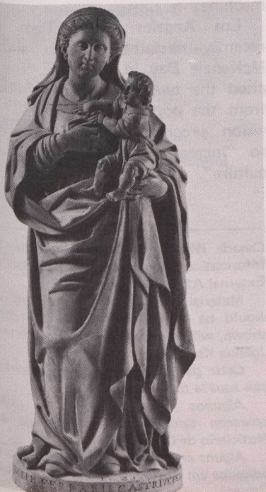
Madonna and Child, Giuseppe Ferraro, a Sicilian, terracotta sculpture, 57.5 centimetres high, signed and dated 1623, from the ROM collection.

The exhibition provided an opportunity to view many Royal Ontario Museum treasures not accessible because of the museum's current building project.