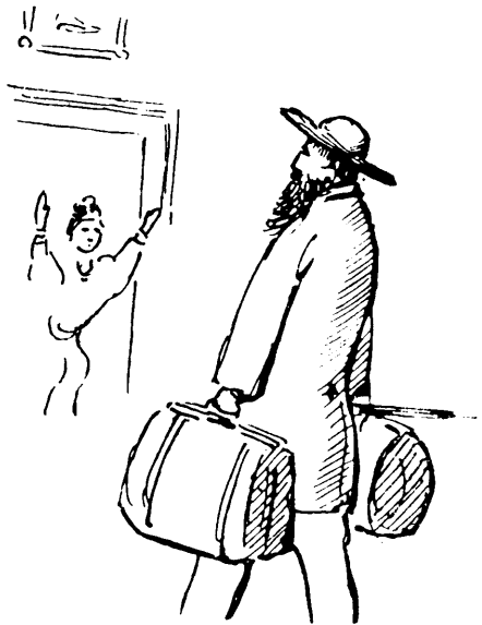
I REJOIN MY WIFE.

I noticed that an Indian boy, about twelve years old, with his hair cropped short, was dusting the things and looking at me furtively. I noticed that there was a well-filled glass book-case, with a pair of polished buffalo horns over it, and some Indian thugs of bead work suspended. I noticed that over the mantel-piece was a familiar engraving, in a frame, a pair of stag horns over it, and above a wooden bracket with two