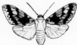
Fig. 29.— Halisidota maculata , Harris.

of producing moths, tachina flies somewhat like the ordinary house-fly, except in size, or four-winged ichneumon flies will be seen in our breeding cages. Such surprises, however, are not always disappointments, as a knowledge of our parasitic, or beneficial, species is of much value. Were it not for these parasitic forms, our native species of injurious insects would soon multiply enormously and quickly destroy all vegetation,