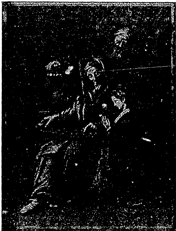
SAINT ANNE and the BLESSED VIRGIN