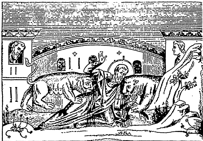
SAINT IGNATIUS, MARTYR.