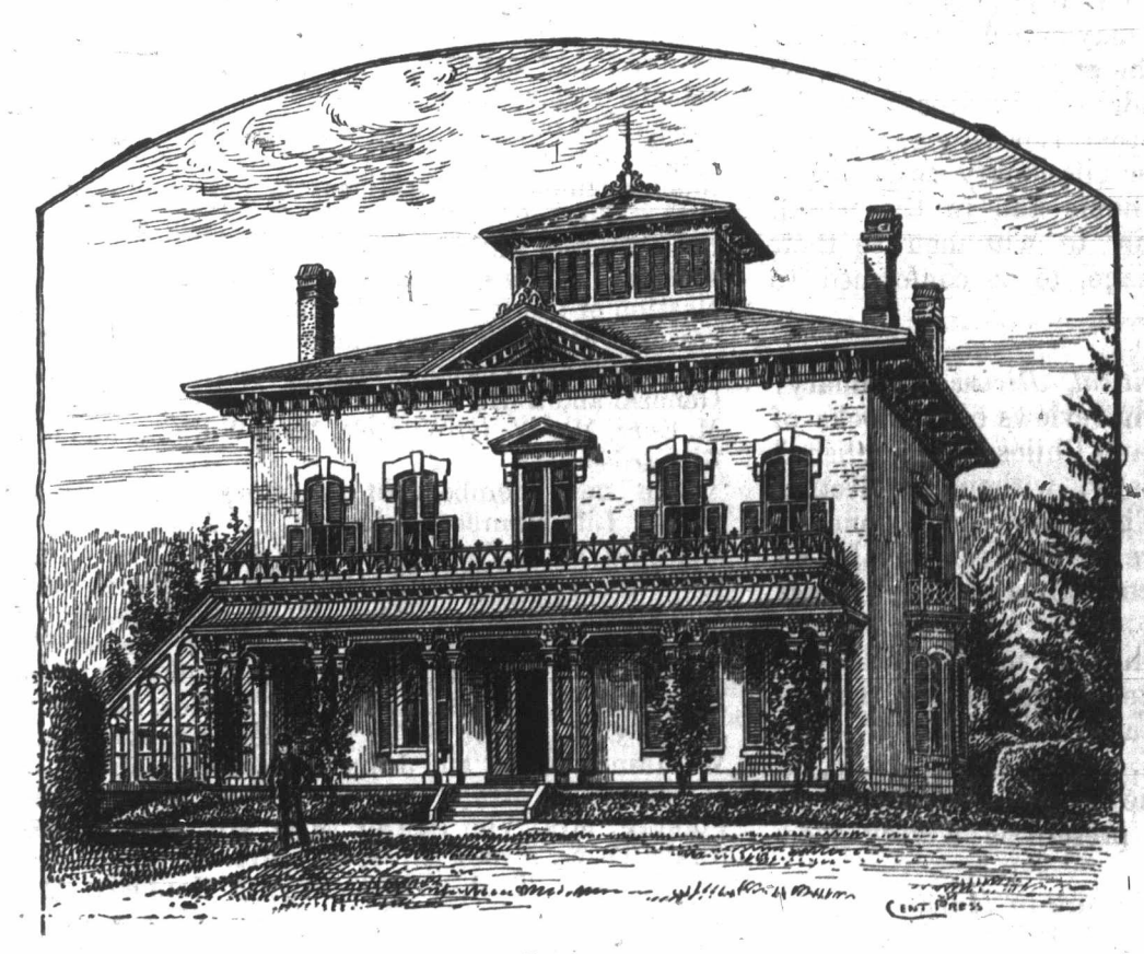
ST. PETER'S HOME FOR INCURABLES.

lucidity and precision. Among other excellent features of this indispensable volume there is a full index, rendering reference to its contents quite easy. We test it by turning to the difficult subject of the Previous Question, and we find the following points treated: "Its meaning and object in Canadian legislatures. Cannot be moved on an amendment; but can be moved, if amendment be withdrawn or negatived. When moved, no amendment admissible. Adjournment of house or debate admissible; but not, if house resolves that the question shall now be put. Does not stop debate in Canadian legislatures. When carried, debate ceases and vote