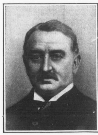
THE LATE CECIL RHODES