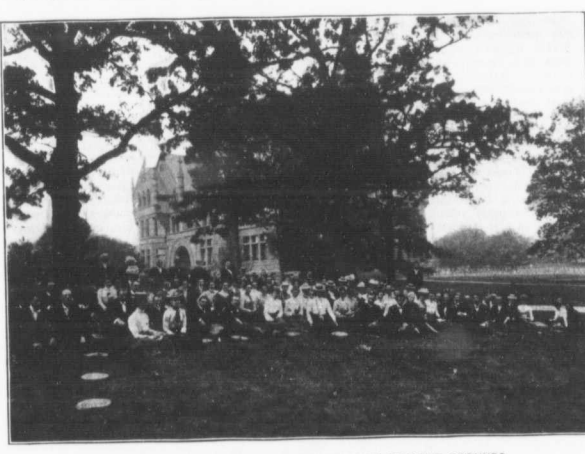
A SUMMER SCHOOL CLASS ON THE VICTORIA COLLEGE GROUNDS.

Said a mother to me one day: "When Said a mother to me one day: When my children were young I thought the very best thing I could do for them was to give them myself. So I spared no pains to talk with them, them was to give them myself. So I spared no pains to talk with them, to read to them, to teach them, to pray with them, to be a loving companion and friend to my children. I had no time to indulge myself in many things, which I should have liked to do. I was so busy adorning their minds and cultivating their hearts' best affections that I could not adorn their bodies in fine clothes, though I kept them neat and comfortable at all times. I have my reward now. My sons are ministers of the Gospel; my My sons are ministers of the Gospel; my grown-up daughter is a Christian woman. I have plenty of time now to sit down and rest, plenty of time to keep my house in order, plenty of time to indulge myself, besides going about my Master's business wherever he has need of me. I have a thousand beautiful memories of their childhood to suffer the solution. childhood to comfort me. their that they have gone out into the world, I have the sweet consciousness of having done all I could to make them ready for whatever work God calls them to do."—Life and Faith.