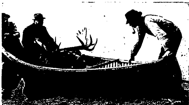
THE RETURN FROM THE MOOSE HUNT.