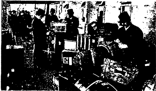
CHECKING BAGGAGE ON BOARD TO DESTINATION.

SPECIAL DELIVERY OF BAGGAGE. —Passengers for Montreal, Quebec, Ottawa, Toronto, Hamilton, Winnipeg, Vancouver, or Victoria, and the larger cities in the Eastern United States, may now have baggage checked by any agent of this Company through to any residence, hotel, steamship dock, or railway depot, in such cities. This is a convenience. The transfer charge to be paid the baggage master at time of checking.