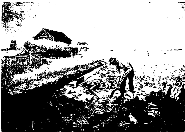
AN IRRIGATED FARM NEAR CALGARY, ALBERTA.

The Canadian Pacific Railway Company offers irrigated lands for sale in the Irrigation Block, comprising 3,000,000 acres adjoining the Main Line, East of Calgary, Alberta. In this block the Company is constructing a most extensive system of canals and ditches to supply water for irrigating the land, which, when irrigated, offers special advantages for the growth of grain fodder crops, sugar beets, market gardening, etc.