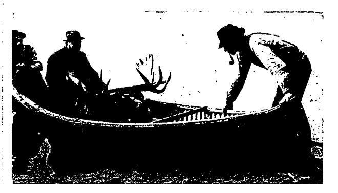
THE RETURN FROM THE MOOSE HUNT.