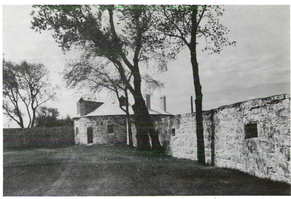
The south-west bastion was used as a wash-house and cook-house, later as a storehouse and still later as a summer

The new development program will include restoration of the Warehouse/Penitentiary, the Men's House, the