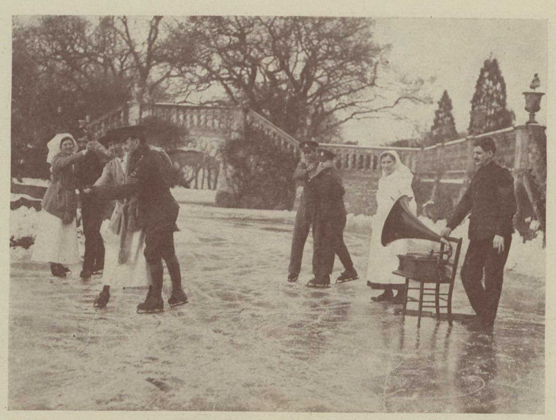
WINTER SPORT AT KINGSWOOD.

England, so that our patients have not been able to get out much for an airing in the grounds.