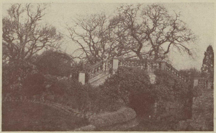
ORNAMENTAL WATERS AND BRIDGE IN GROUNDS

Before leaving the Home, Patients are desired to hand in to the Orderly or Sister in Charge of their Ward, their Pyjamas, Towels, Slippers, Collars and Ties; also any books on loan from Lending Library.