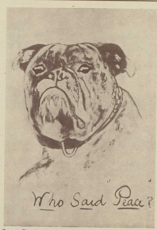
Crayon Drawing by Corp. Linfoot, one of the orderlies at Kingswood. The Original Drawing hangs in the orderlies' room

Like most of the Concert parties that visit Kingswood, these young ladies are mostly employed in offices and shops in the City during the day, and spend their spare time in the