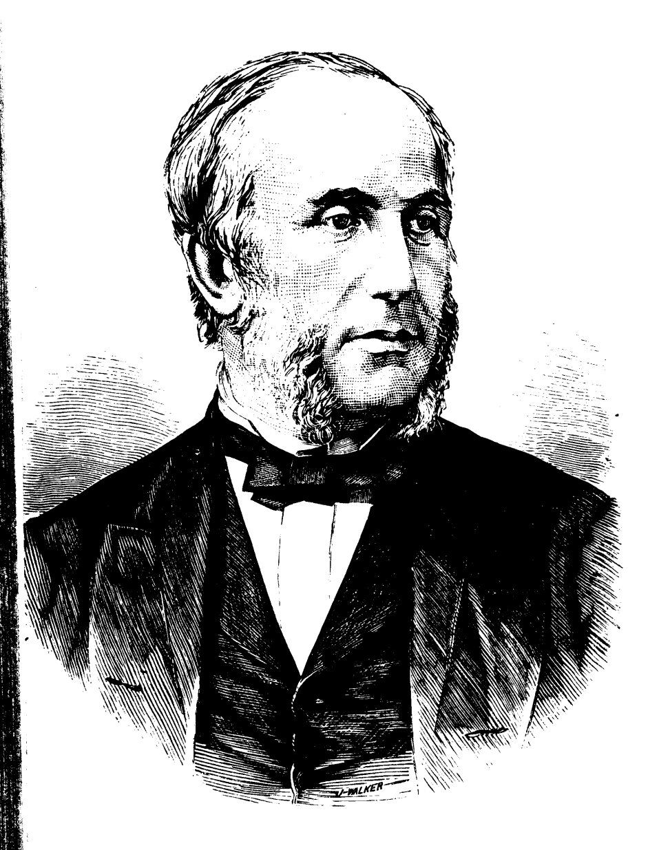
HON. GEORGE BROWN.