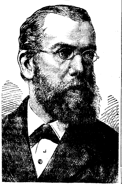
DR. ROBERT KOCH.

port of the Medical Health Officer shows that there are "4,396 premises without drainage, and 1,421 with defective drainage, 1,538 foul wells, 1,162 foul cisterns, 3.936 full privies. 1,996 foul privies (are there any privies that are not foul? we would ask), 2,444 unclean yards, and 512 places where no water at all was provided. "The evils in connection with the privies have been in many cases removed; but many remain. The want of drainage is a crying evil." After describing such a condition, "W. C." need hardly have informed the readers of The Week that "While the city remains in this condition it is far from being in a sanitary condition."