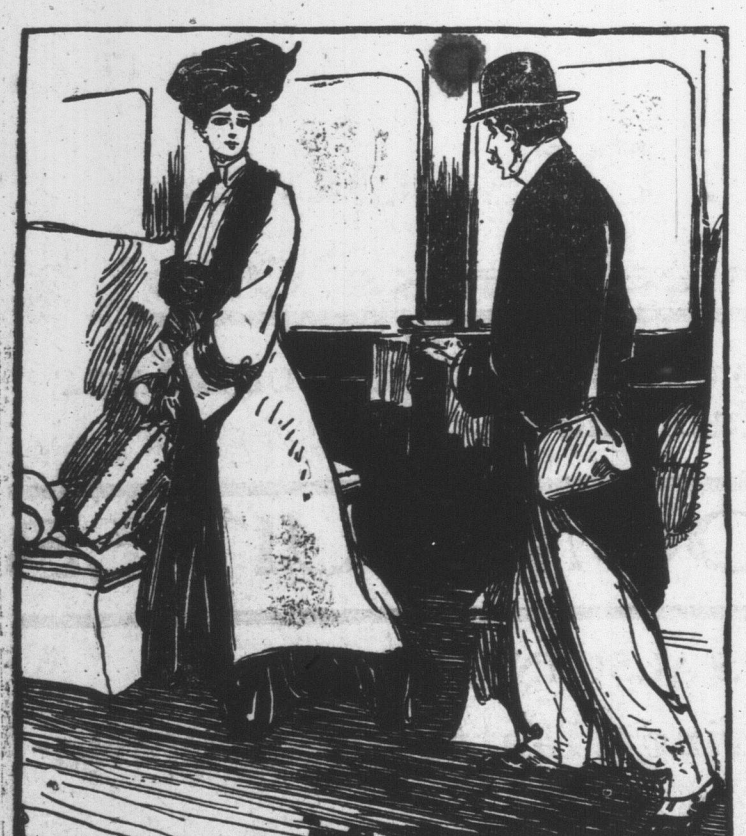
"YOUR BAG SLIPPED OFF ON THE FLOOR," SHE SAID.

"And I give you my word, I was such an ass that I did open the case and looked all through it. She must have thought I was a Juggins. I get hot all over whenever I remember it. But in spite of my