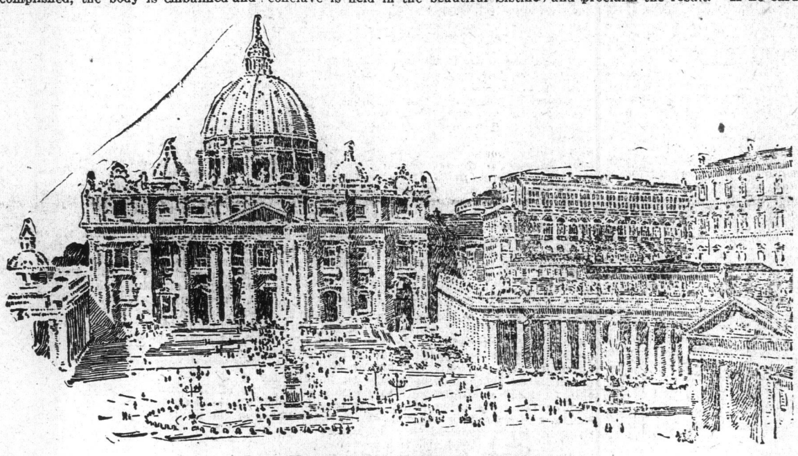
St. Peters and the Vatican