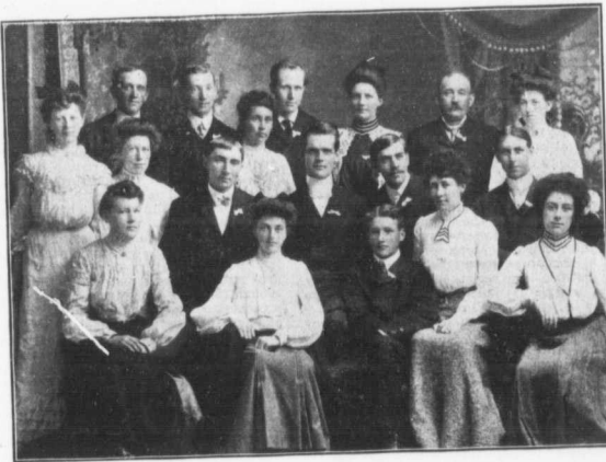
OFFICERS OF THE EPWORTH LEAGUE, RAT PORTAGE, ONT.

At the Elgin Epworth League recently, in the unexpected absence of the appointed leader, the pastor took the