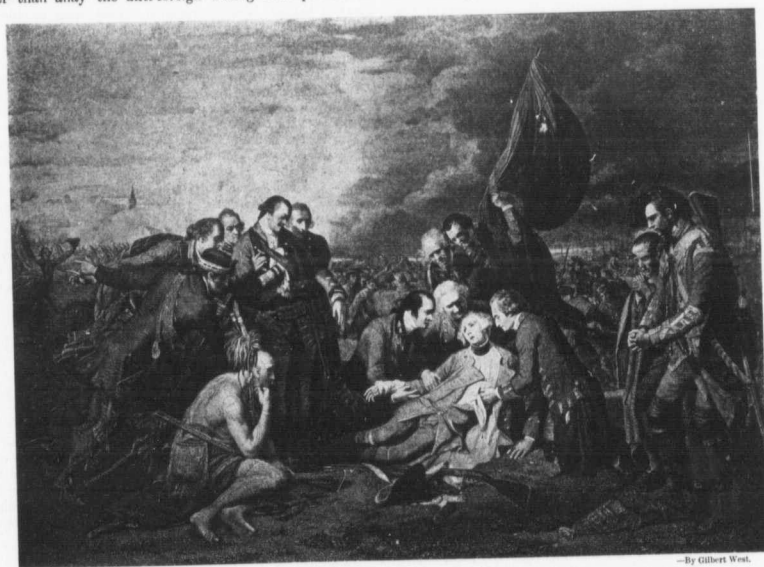
THE DEATH OF WOLFE

We believe that God is in all these world movements and He is calling our attention to the greatest battle-ground of