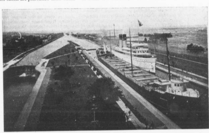
THE POE AND WIETZEL LOCKS ON THE U.S. SIDE, SAULT STE. MARIE.

last fall, when what is called the "crash" came and all operations were stopped. The walls were up about ten feet, and there they stand in an unfinished condition to-day. The lecture room, however, is complete, with its seating capacity of about five hundred, and all services are held there. The