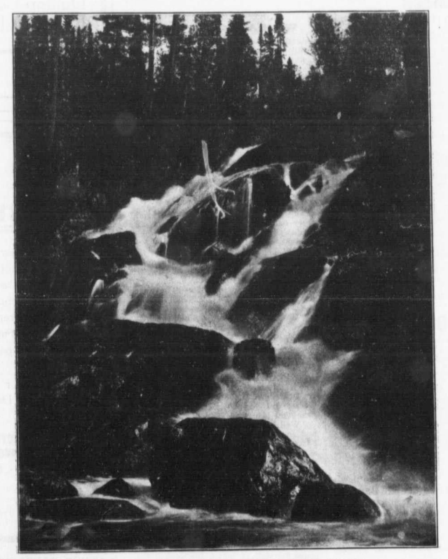
SILVER CREEK FALLS, NEAR SAULT STE. MARIE