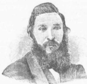
TUMOR OF THE SPLEEN AND DROPSY—A MANY MONTHS CURE.

I hereby submit the following to the public, that any who may be afflicted as I was may be benefited by the same remedy that I used so successfully. In June, 1884, I was examined by my family physician, and the presence of a tumor, or enlargement of the spleen, was discovered. By December of that year my condition had become alarming, and in January, 1885, I had two attacks of vomiting blood, which was all but fatal. The Tumor of the Spleen by this time filled half of my abdomen, and was estimated to weigh about six pounds. Dropsy of the legs and body followed, and I became so prostrated as to be unable to sit up for many weeks. My skin took on the waxy pallor and yellow hue so characteristic of severe disease of the spleen, as my physician said. Besides my regular medical attendant, I had counsel from two other doctors, and no hope of recovery was held out to me. It was the opinion of all who saw me that, though I might live for a time, I would never regain strength or anything approaching good health.