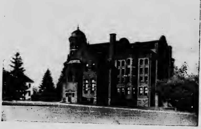
Massey Hall and Library, O.A.C., Guelph