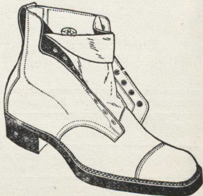
"K" Service Boot

Campaign, Riding, Dress and Long Boots always in stock, in sizes and half sizes . . .