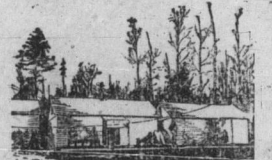
Single Life at Muskoka Free Hospital for Consumptives.

The trial was the severest in the history of these Muskoka Homes, in which nearly 3,000 persons, stricken by the dread white plague, have been cared for.