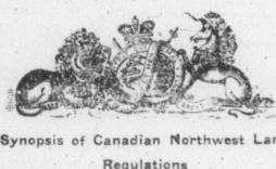
Synopsis of Canadian Northwest Land Regulations

Any person who is the sole head of a family, or any male over 18 years old may homestead a quarter section of available Dominion land in Manitoba, Saskatchewan or Alberta. The applicant must appear in person at the Dominion Lands Agency or Sub-Agency for the district. Entry by proxy may be made at any agency, on certain conditions, by father, mother, son, daughter, brother or sister of intending homesteader.