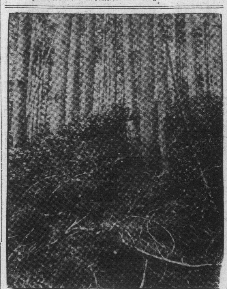
TYPICAL TIMBER AT NOOTKA

the record that there were no surviv-ors, or indeed, with Suter's age, which safe places in which to drink it; their must be a good deal less than 100 years. remark being "that in Victoria a