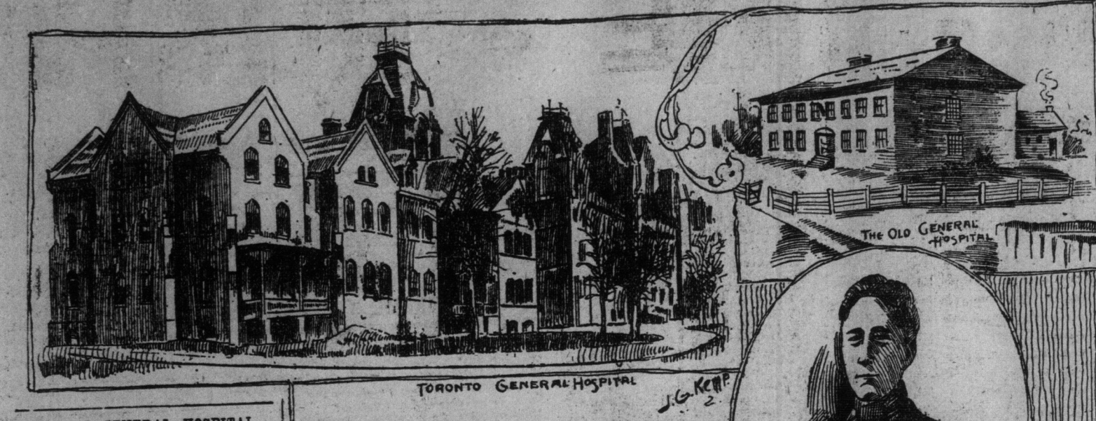
TORONTO GENERAL HOSPITAL. An Institution Which has Done Great Service to the Suffering of Humanity.

Toronto is noted for its philanthropic institutions, foremost among which ranks the General Hospital in the Burnside Building. It is one of the most useful and beneficent agencies for the relief of suffering on the continent.