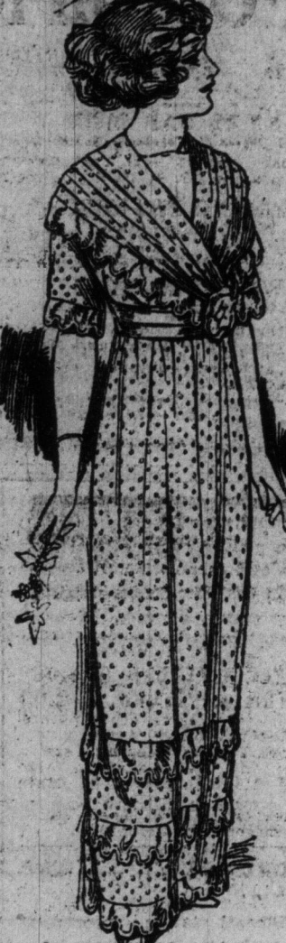
Quaint Gown of Challis.