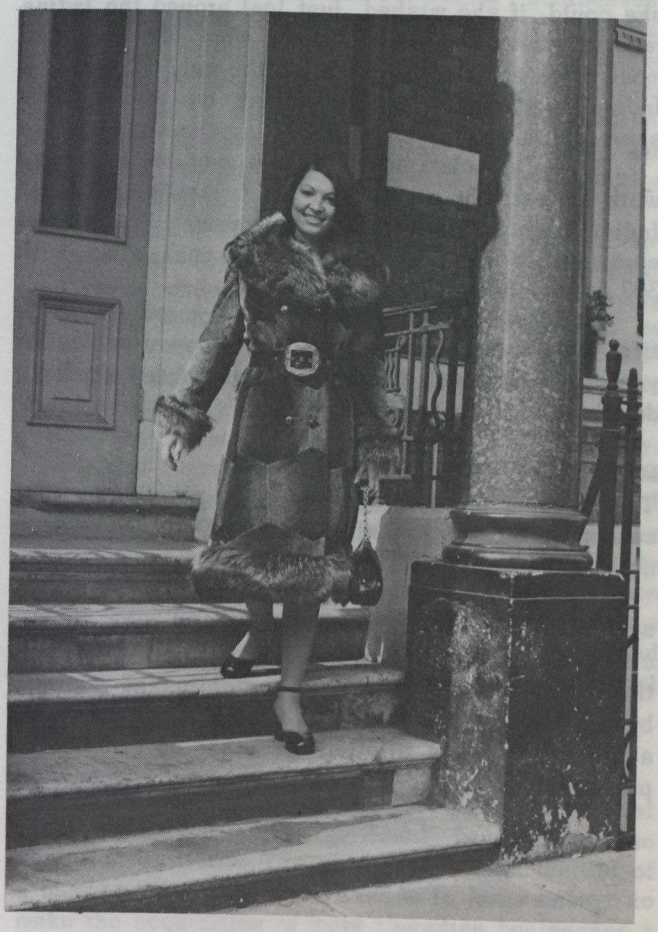
This imitation muskrat coat has real Canadian racoon collar, cuffs and bottom trim.