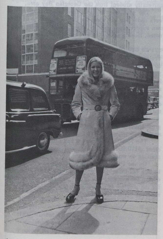
A leather coat trimmed with kit-fox.