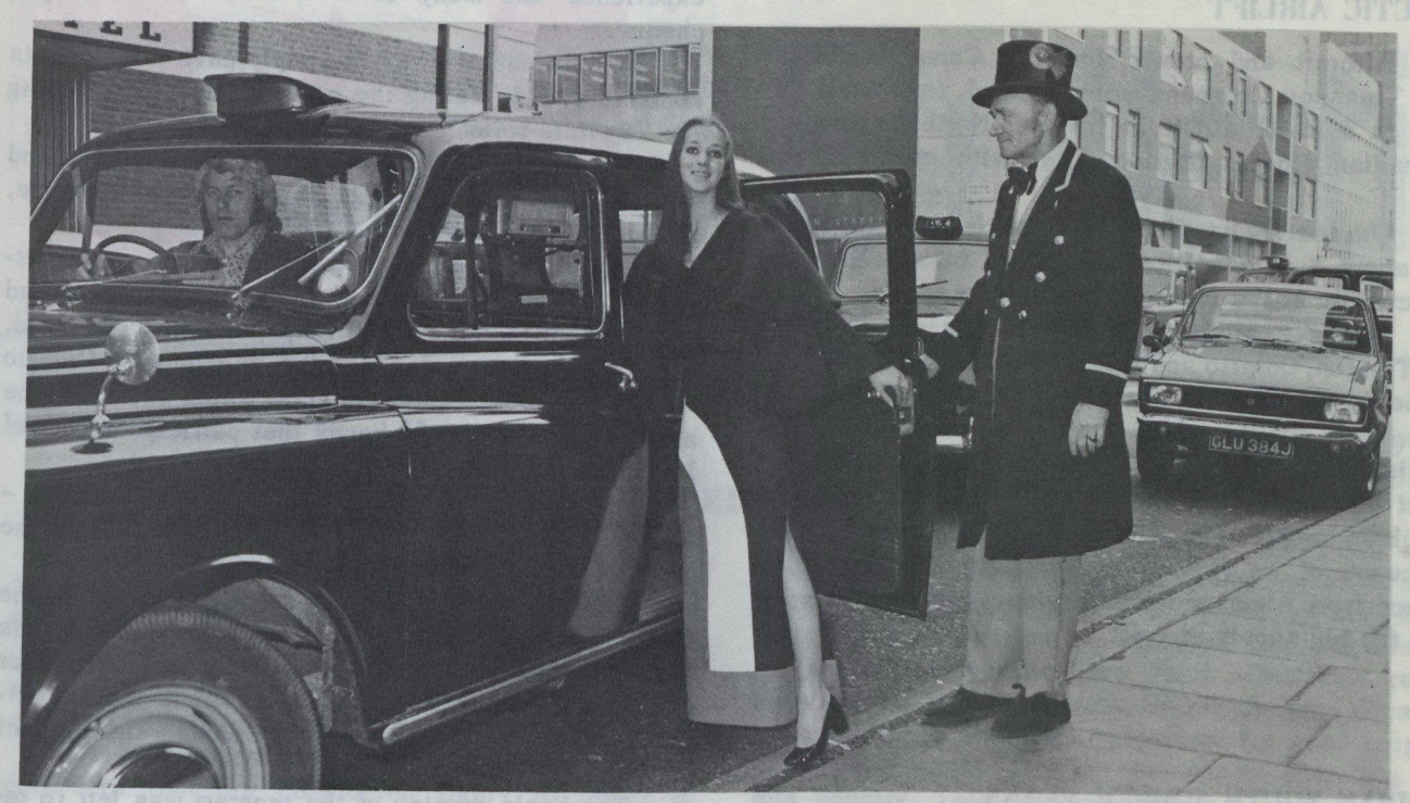
A chiffon top with full double-tiered sleeves is combined with a skirt of double-knit polyester.