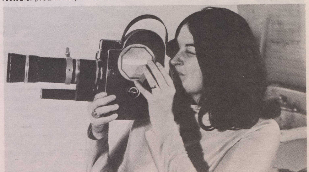
Over the past 40 years, Canadian women film-makers have created many fine films, achieved commendable results in form and content, and have received national and international recognition.

As part of the architectural exhibit at the festival, display models of Canadian performing facilities, were shown including the National Arts Centre in Ottawa, the Shaw Festival Theatre in Niagara, and Roy Thompson Hall in Toronto.