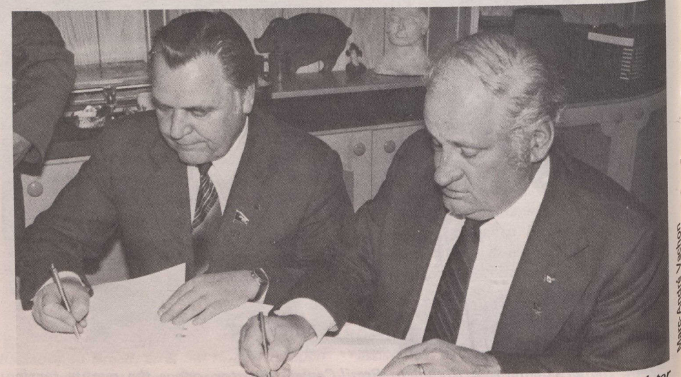
Soviet Agriculture Minister Valentin Mesyats (left) and Canadian Agriculture Ministel Eugene Whelan sign co-operation protocol.

The Soviet delegation concluded its visit with a tour of farms and agricultural facilities in the Montreal area.