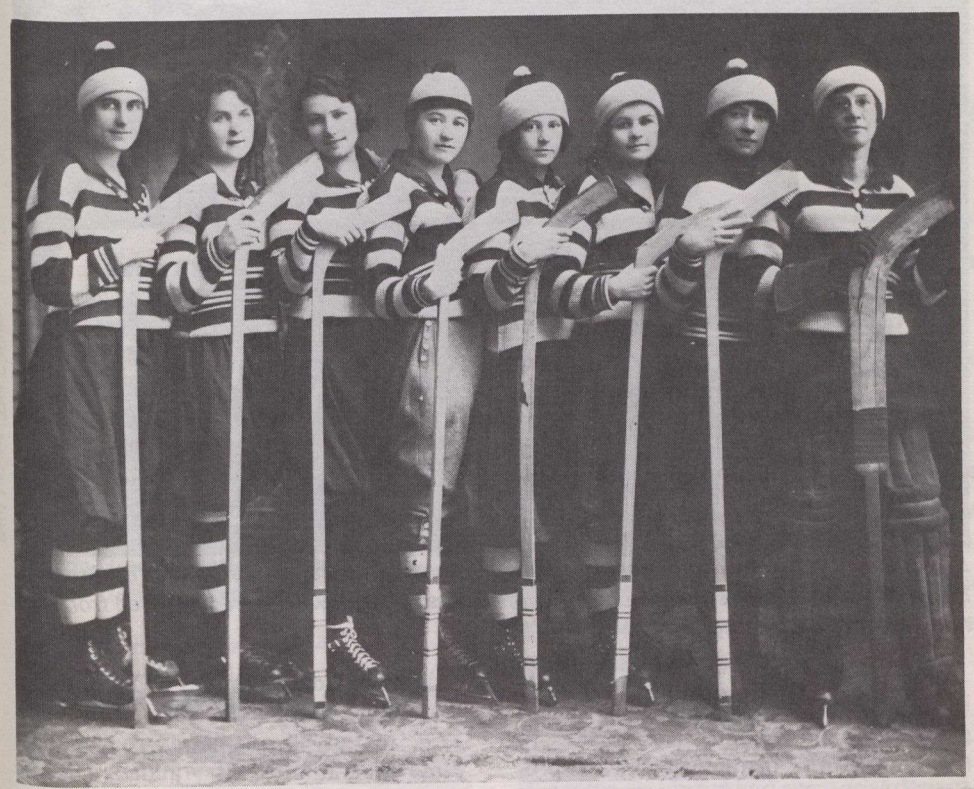
Women in Canada exhibition shows girl hockey players from Manitoulin Island, Ontario.

The National Library of Canada and the Public Archives of Canada are presenting an exhibition on women in Canada during the years 1870-1940.