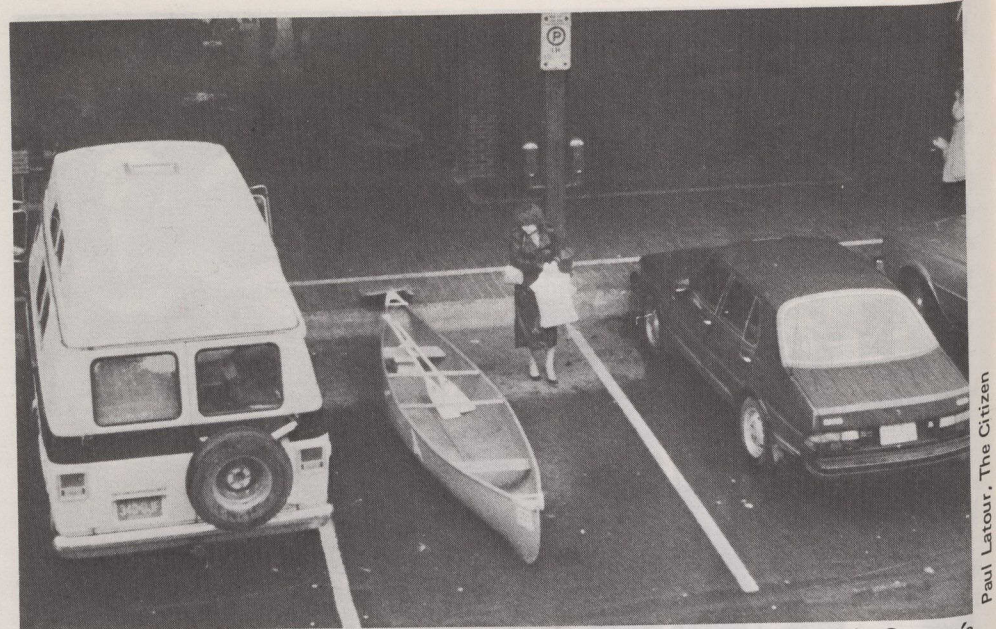
Like many passers-by, this woman seems curious about the canoe parked in Ottawa's Byward Market. It was being sold by three Swiss tourists who were sheltered from the rain in the van, awaiting buyers.

RMS Industrial Controls Incorporated of Port Moody, British Columbia has been awarded a contract to supply monitoring units for advanced light rapid transit vehicles being built for three North American cities. The company will supply up to 200 units to monitor the conditions of electronic sub-systems aboard rapid transit vehicles in Toronto, Detroit and Vancouver.