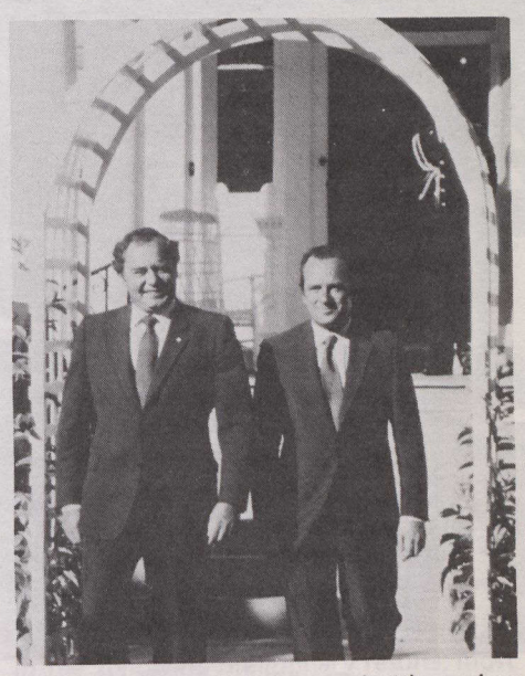
Governor General Schreyer (left) receives Portuguese Prime Minister Balsemão during his visit to Canada last month.

After a meeting with Deputy Prime Minister and Secretary of State for External Affairs Allan MacEachen, Mr. Balsemão attended a luncheon given by the National Press Club. In the afternoon of October 5 he was received by Governor General Edward Schreyer at Government House.