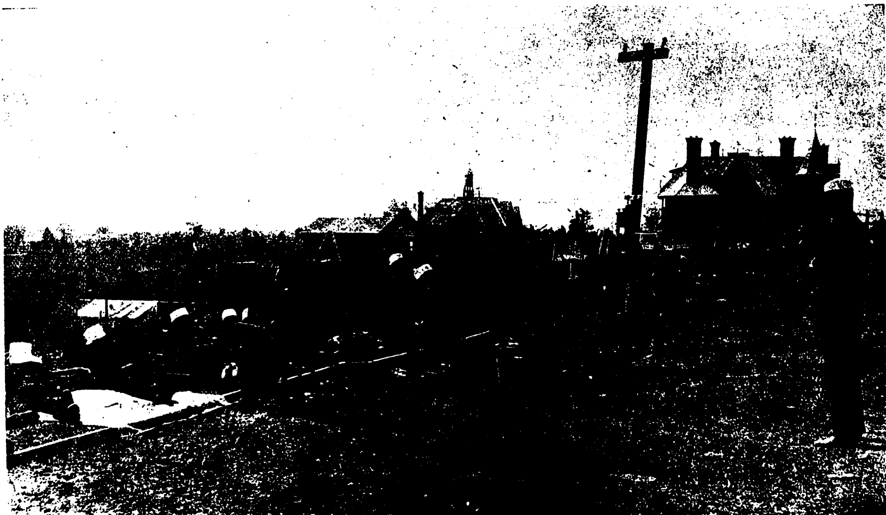
ON THE RIDEAU RANGES, OTTAWA. During the D. R. A. Matches.