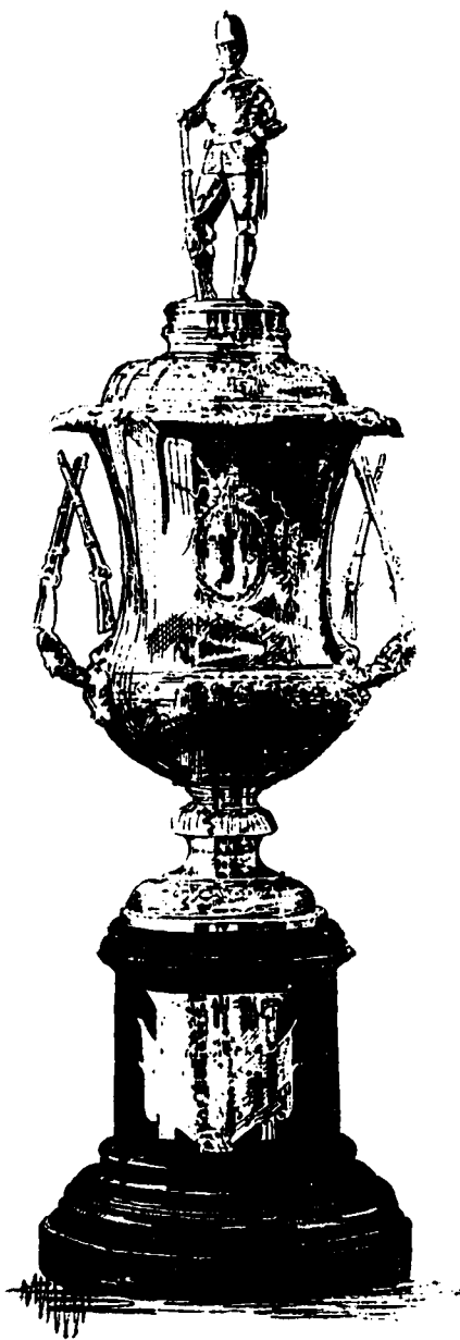
The Gzowski Cup.

Subscription $2.00 Yearly. Single Copies 10 Cents