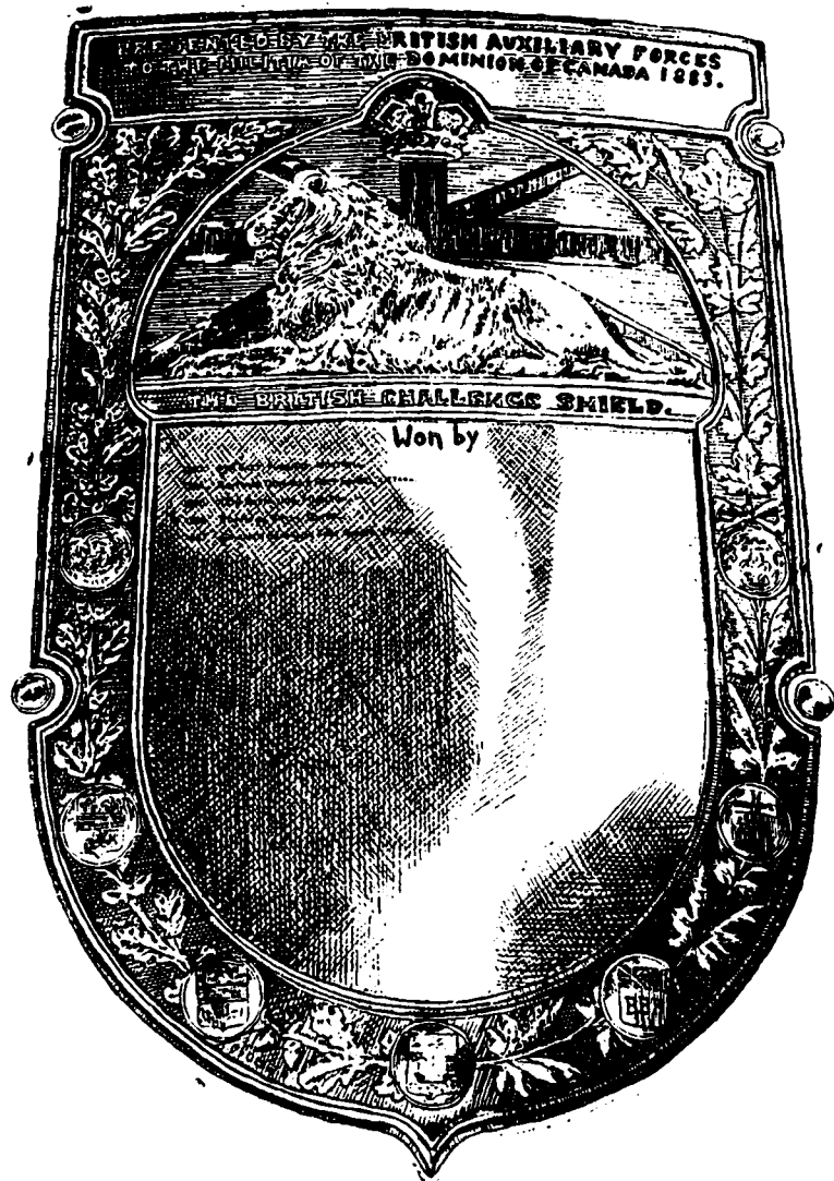
THE BRITISH CHALLENGE SHIELD.