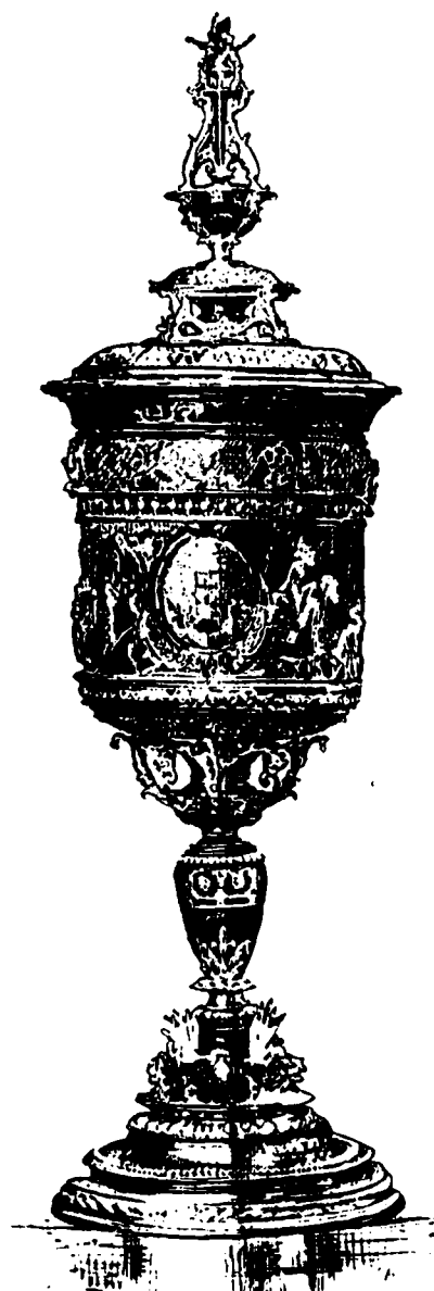
The London Merchant's Cup

THE DOMINION RIFLE ASSOCIATION MATCHES, 1892.