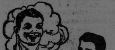
"Every Meal Smiles at Me Now Since I've Been Taking Stuart's Dyspepsia Tablets."

Make up your mind to go to your next meal with the desire to eat what you will and do it.