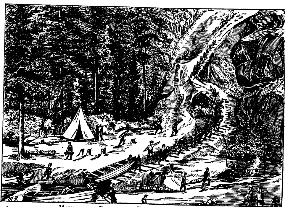
MAKING THE PORTAGE AT KAKABEKA FALLS, (SEE PAGE 87.)

As a general thing where rapids existed the banks of the river were very steep,