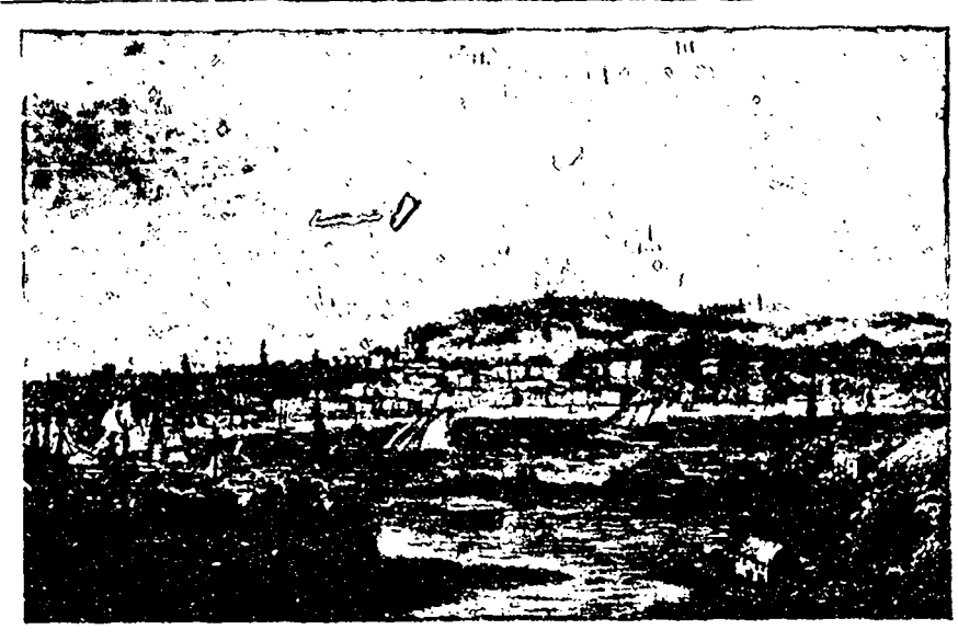
HALIFAX IN 1837.

gation purchased, and it remained amongst them till it was replaced by a better one in 1841. Regarding this organ and the choir connected with it, it is interesting to note the following resolutions passed in Halifax on the 24th of July, 1770, at a vestry meeting: