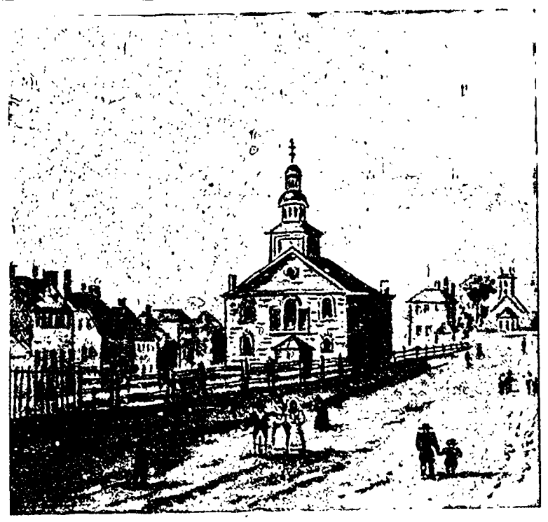
ST. PAUL'S CHURCH, HALIFAX, N.S., IN OLDEN DAYS.