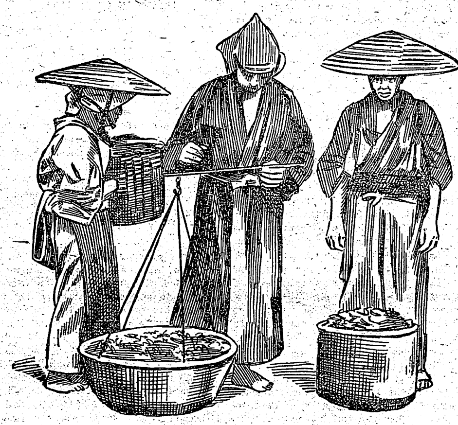
TEA-WEIGHING IN JAPAN.

It may be safely said that tea has contributed more to the sobriety of nations than the severest laws, or the best moral treatises; and it is certain, that the alliance between coffee and literature is notmore close than that between tea and theology. The progress of dissent, especially of Methodism, has been blended with the tea-cup; and though there is no intention in this paper to trace the connec-