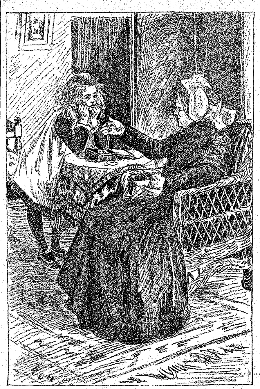
PLEASE TELL ME ABOUT IT, GRANNY,' FLOSSIE SAID, RESTING HER FACE IN HER HANDS.