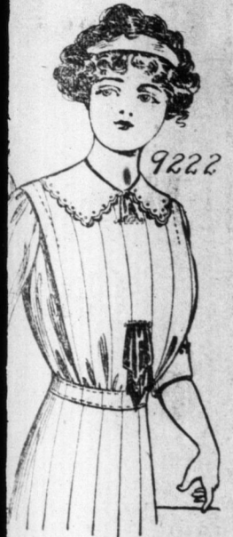
Waist (closed at the back) with Two Styles of Sleeve.

Dressmaker should keep Scrap Book of our Pat- these will be found very er to from time to time. PLE PRACTICAL WAIST MODEL.