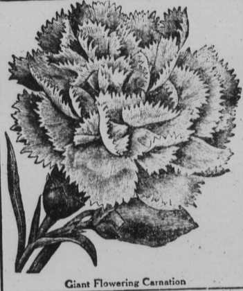
Giant Flowering Carnation