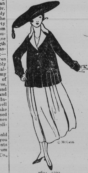
Box Coat of Green Jersey Cloth with White Pleated Skirt

Some of the Spring hats combine straw and fine felt, or straw and satin, others are entirely of straw trimmed with flowers or ribbon, and a great many are of crepe. An almost brimless, rather high-crowned little hat was fashioned entirely of narrow ribbon interlaced, giving the impression of straw, at a distance. It was of narrow blue ribbon with a tiny red border on either side. The trimming was a bunch of red cherries placed on the left side of the crown. Another hat with a small up-turned brim was of white silk covered entirely with machine stitching worked in a close allover design. Machine stitching is also very popular just now as a de-