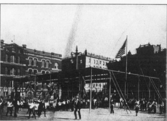
PLAYGROUND IN A UNITED STATES CITY

It is an honor for a man to fight for the land which gave him birth, the land which he has learned to love, if that land be invaded by foreign foe, and to-day we revere and honor the memory of those gallant forefathers who fought, and not in vain, for