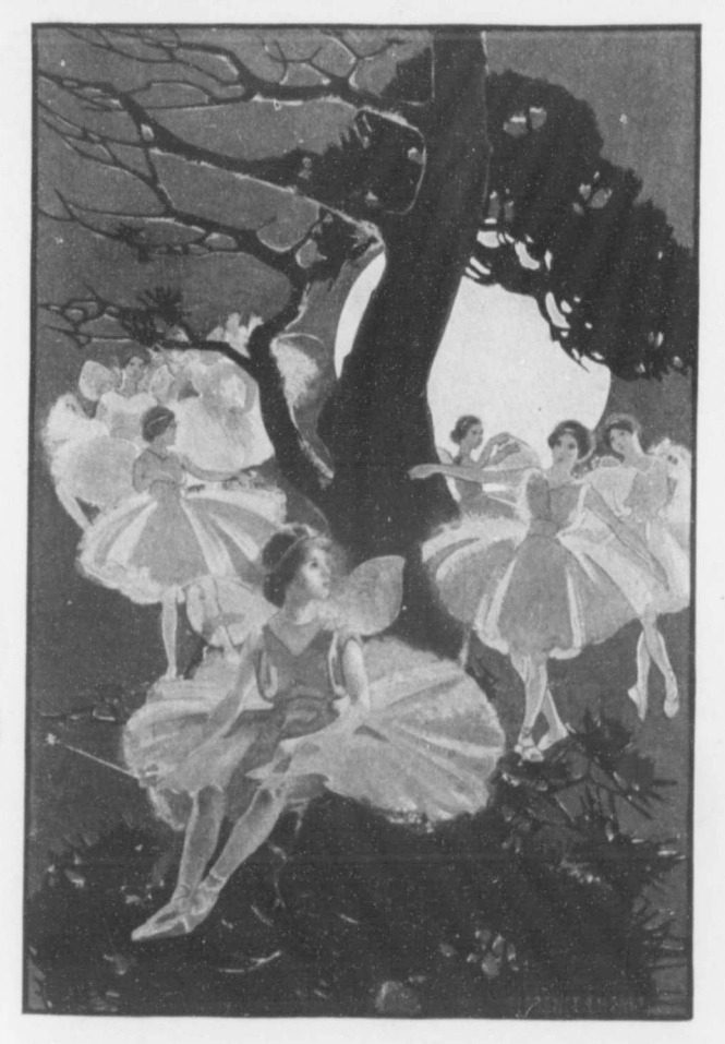
"THE FAIRY QUEEN WAS DRESSED IN GLITTERING GOLD."-Page 101