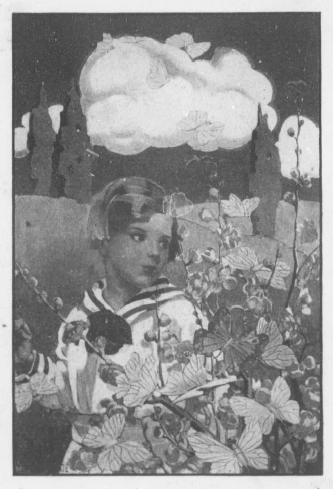
"The butterfly thought, 'this may be my first party, but it won't be my last.' " -Page\ \it 3