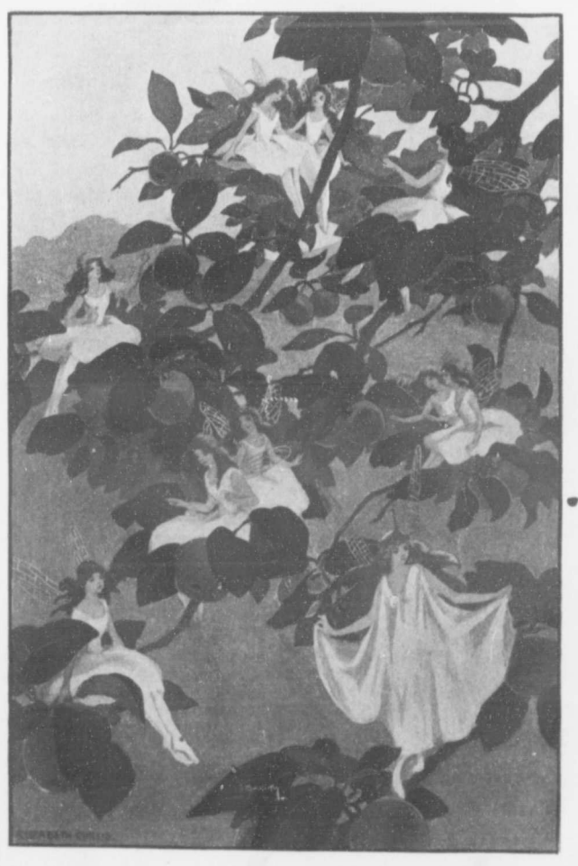
"THE FAIRY QUEEN BRINGS ALL THE LITTLE FAIRIES TO ADMIRE US." -Page 29