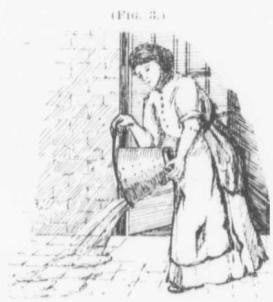
A dirty practice, which conduces to the decay of food in households where it is permitted.

Thus decay in any of its varied forms may actually render food poisonous; it certainly makes it less wholesome; it spoils its appearance; and assuredly it leads to much waste of what should be good nutritious material.