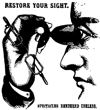
SPECTACLES RENDERED USELESS.

Employment for all. Agents wanted for the new Patent Improved Ivory Eye Cups, just introduced in the market. The success is unparalleled by any other article. All persons out of employment, or those wishing to improve their circumstances, whether gentlemen or ladies, can make a respectable living at this light and easy employment. Hundreds of agents are making from $5 TO $20 A DAY. To live agents $20 a week will be guaranteed. Information furnished on receipt of twenty cents to pay for cost of printing materials and postage. Address, DR. J. BALL & CO., P. O. Box 957 No. 91 Liberty Street, New York.