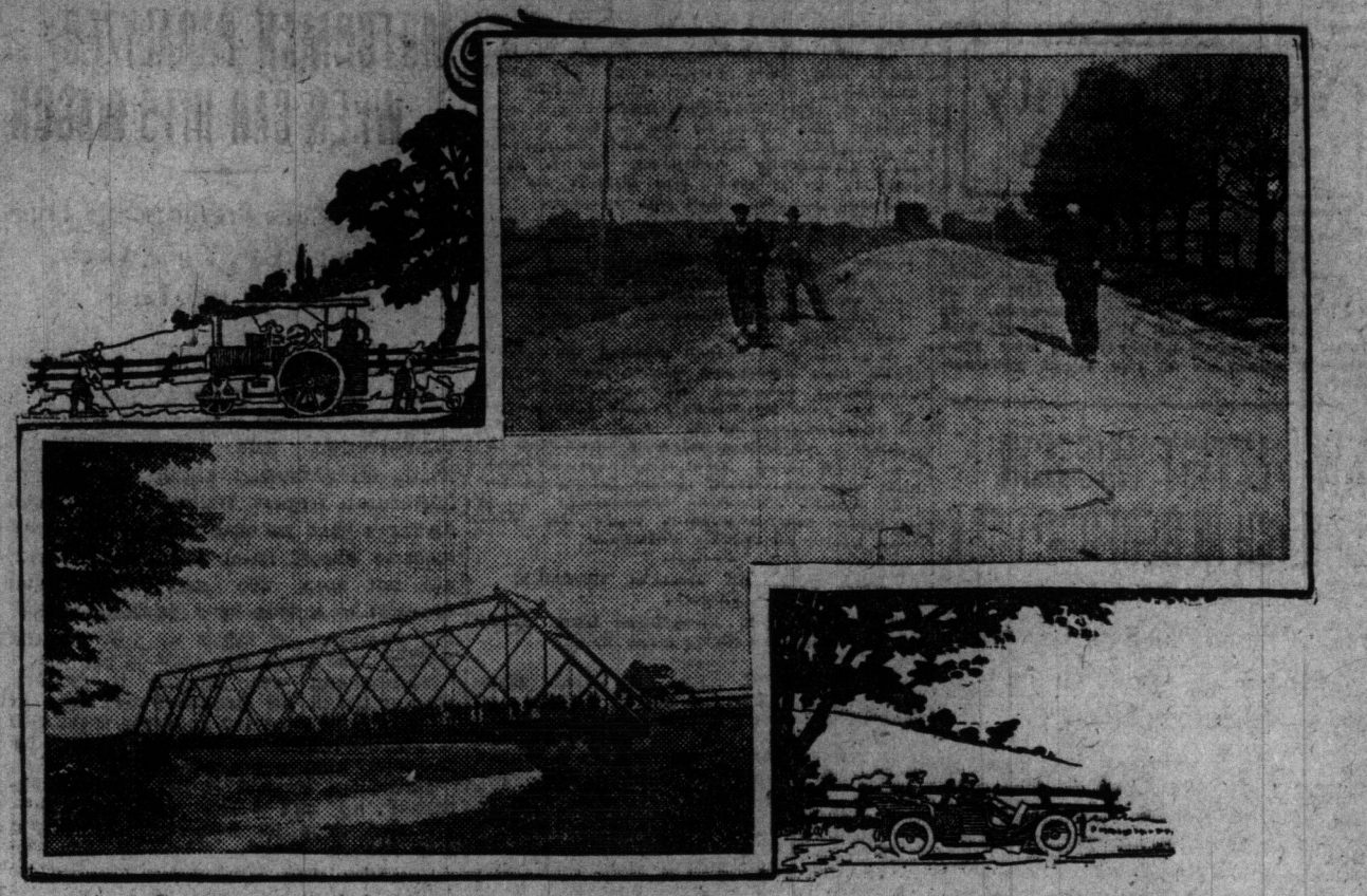
Oxford County is one of the foremost in the good roads movement, and here The World's policy for central administration of the trunk highways is finding generous support.

GRAIN AND PRODUCE. Prices quoted are for outside points: Winter wheat—No. 2 white, 84 1/2c; No. 2 red, 84 1/2c; No. 2 mixed, 84c.