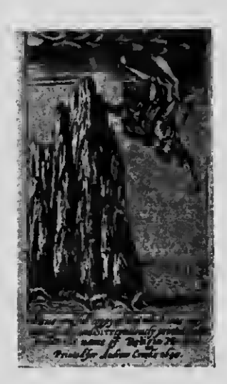
(2). FRONT'ISPIECE OF THE AUTHORIZED EDITION