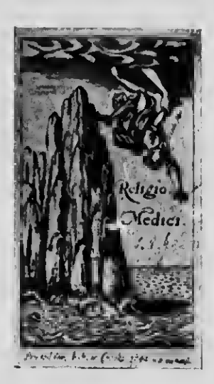
(1). FRONTISPIECE OF THE SURREPTITIOUS EDITION