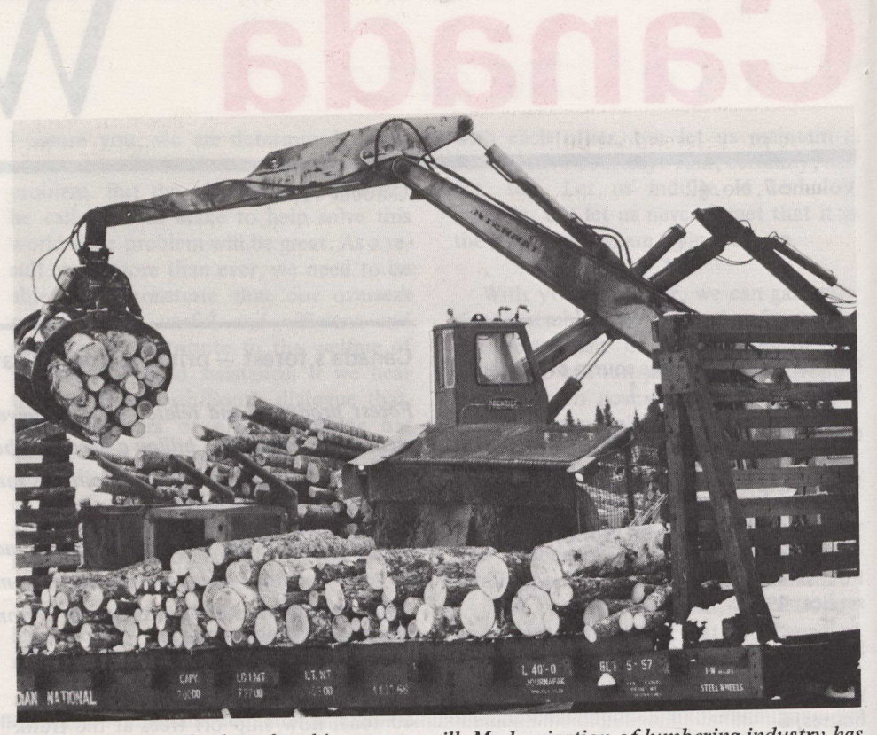
Grapple loader piles logs for shipment to mill. Modernization of lumbering industry has increased the importance of good forest management.

. greater priority for forestry research and development.