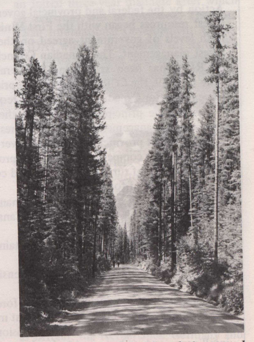
Thirty-five per cent of Canada is covered by forests.