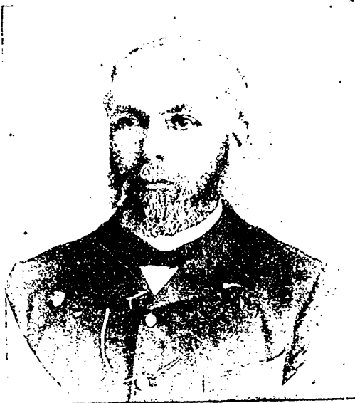
BRO. GEO. GUILLETT, EX-M.P.

He was an unsuccessful candidate for present seat in the Legislative Assembly, Ontario, at the general election in 1870. Was first returned to Parliament, 19th December, 1881, on the resignation of the Hon. James Cockburn. Was re-elected at general election, 1882. Unseated by Judgment of the Supreme Court, 17th March, 1885, on the appeal of the petitioners against the judgment of the Court of Queen's Bench. Was re-elected on the 7th April, 1885. Was again elected in the general election of 1887. Was a candidate in the general election of 1891. Owing to the disturbing effect on the border counties of the newly propounded and imperfectly understood policy of Commercial Union he was defeated by 37. The election