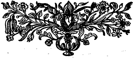
ILLUSTRATION TO VOL. LVI