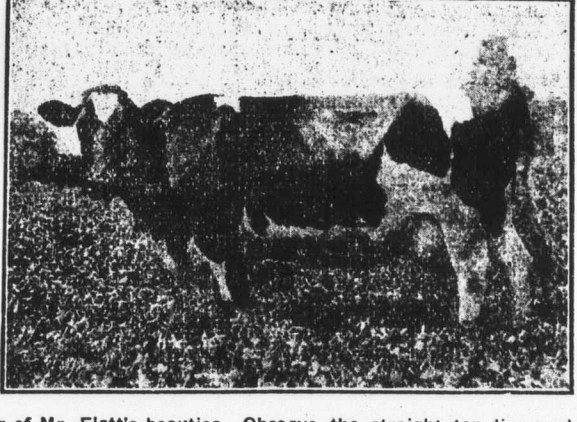
Another of Mr. Flatt's beauties. Observe the straight top line and the Vshaped body of the typical dairy cow. this cow to an extraordinary degree. Utility and quality are combined in

Just because a fellow can't get into the aviation corps he needn't go up in the air about it.