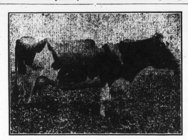
Rarely have we seen a herd of such uniformly high quality as that of Mr. Flatt. Not only are they extraordinary heavy milk producers, but they would hold their own anywhere as show cows.

crop. The varieties of corn that I had been in the habit of growing," contin-