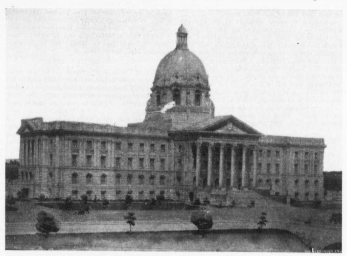
THE PROPOSED LEGISLATIVE BUILDINGS OF ALBERTA

Then we tried it in fear and trembling on our patients, and the delight of seeing the magic it worked! That is an old story now, but it has never lost its charm. To see the cough which has defied "dopes" and syrups and cough mixtures, domestic, patent and professional, for months, subside and disappear in from three to ten days; the night-sweats dry up within a week; the appetite come back; the fever fall; the strength and color return, as from the magic kies of the free