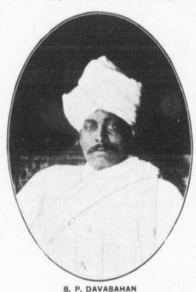
A native of India, and a prominent speaker at the Convention. In spite of the "No applause" rule the audience cheered heartily when he spoke.

who and what is what. Yet Pittsburg has some things worth seeing. The steel mills in themselves are worth the journey. The University of Pennsylvania, with its fine observatory and its different faculties deserves attento; but the trouble is that its buildings are scattered all over the city. The two things concerning which Pittsburgers may properly and proudly use superlatives are the Carnegie Institute and the Carnegie Technical School. The Institute is open to the public, and one may easily spend a day roaming through its hall of architecture and statuary, its art gallery, its museum, its circulation library, its