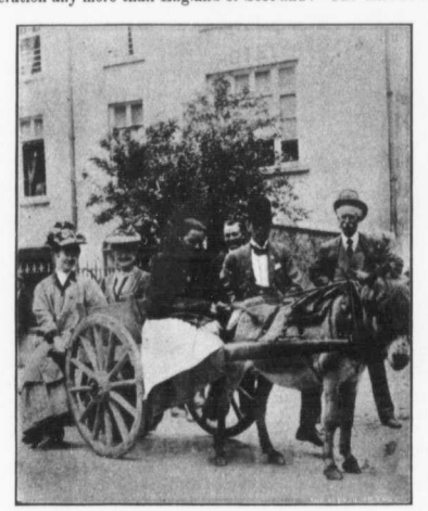
AN IRISH MARKET CART

Ireland is the land of such men of genius as Burke, O'Connell, Moore and Goldsmith, and yet we say "Poor Ireland"! Why should such a goodly land be the subject of our commiseration any more than England or Scotland! The answer is