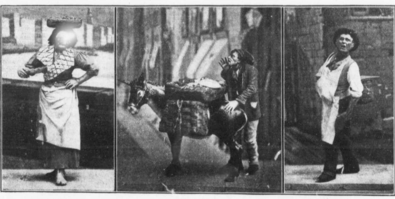
SHELL FISH SELLER

From every part of Naples old Vesuvius towers up grandly, and the view over the bay with the surrounding towns and villages is unsurpassed in the world. Ambitious visitors climb to the crater of Vesuvius, but unless the day is very clear the journey scarcely pays, as it is expensive and tire-some. The most interesting side trip is the run out to Pompeii. The temptation is strong to write an account of a day spent in Pompeii, but this must be resisted, as the place has already been described in these pages and it is more or less familiar to everybody.