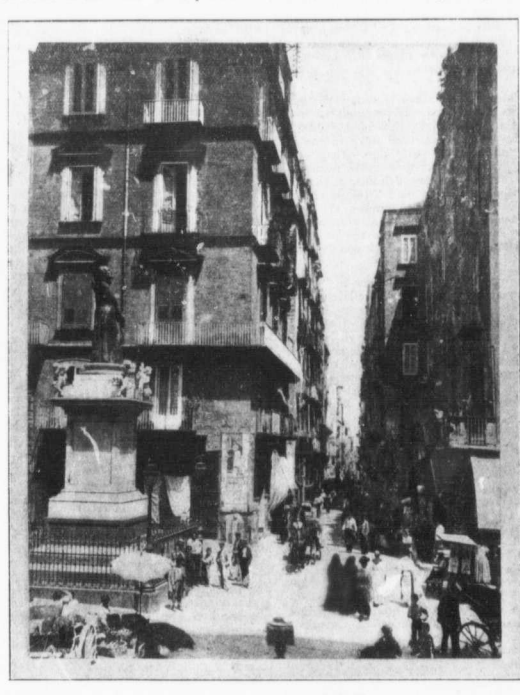
A TYPICAL STREET IN NAPLES

When the house-wife who lives in a flat on the fourth story