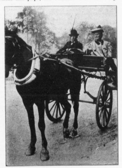
AN IRISH JAUNTING OAR

The lessons that we have to learn from the lives of reformers is, that they saw the approach of the Goths and the Huns, warned their people, and awakened them to the danger.