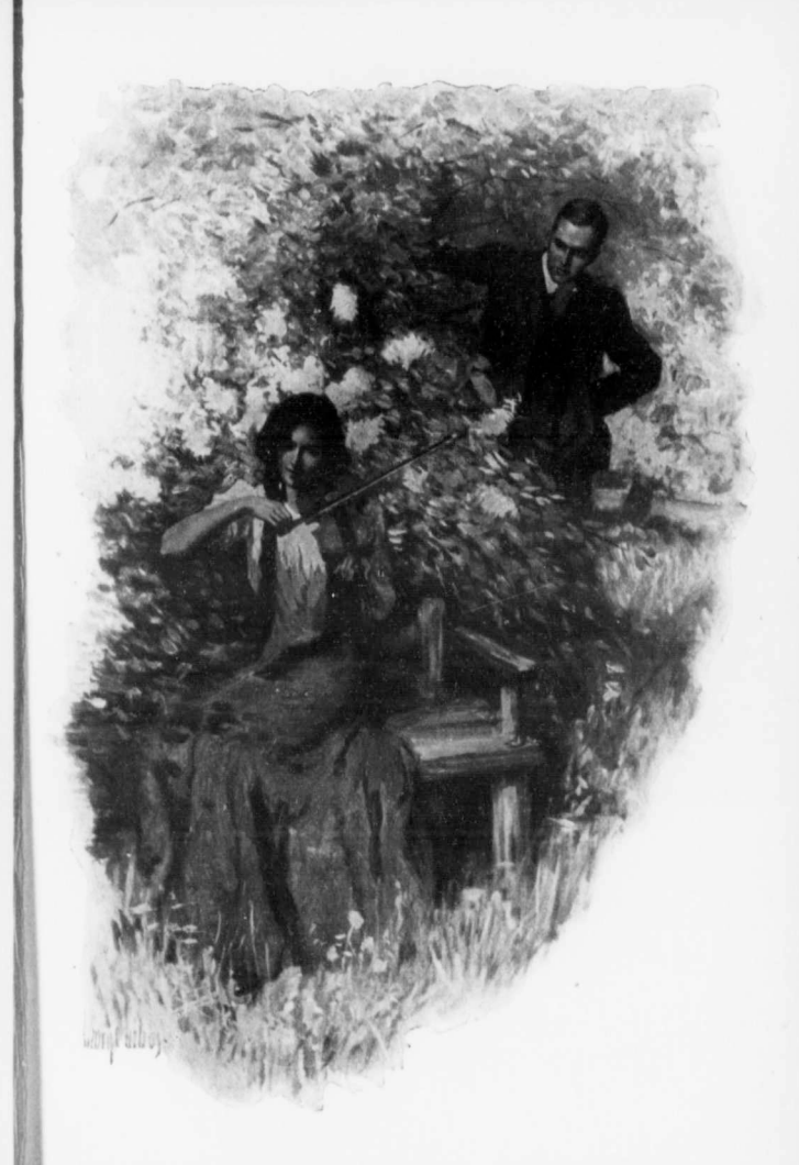
" FOR A FEW MOMENTS HE STOOD THERE AND LOOKED AT HER."