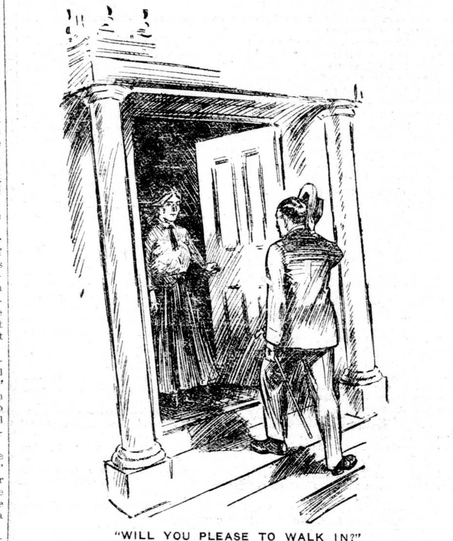
"WILL YOU PLEASE TO WALK IN?"