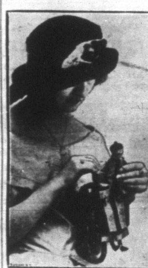
there is no reason to believe that as a majority of the voters. Lass a majority of the voters. Lass a majority of the voters. Lass a majority of the voters. Lass against him and so are the crais and the Catholic party. All sorts of queer vanity bags are seen these days in Paris. This one represents a Chinese figure. It has compartments for a mirror, powder, respondent of the Loudon Daily Chronicle:

She-"Did you meet any stage robhers while you were out West?" He-" Yes, I took a couple of chorus girls out for dinner "