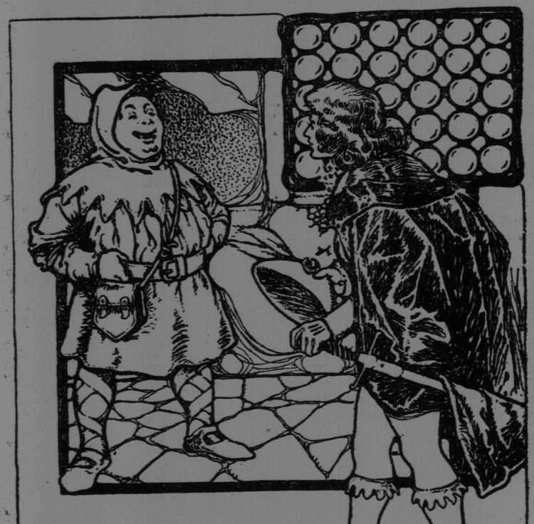
Young King Henry was lost in the forest while hunting and stopped at a jolly miller's to ask for lodging for the night. (From an Old English Tale.) Find the miller's wife.

ANSWER TO YESTERDAY'S PUZZLE: Upside down, in foliage.